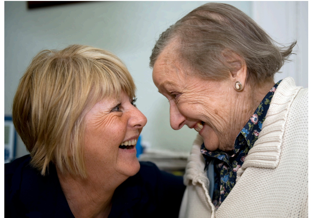
A patient information guide for those living within Uists and Barra