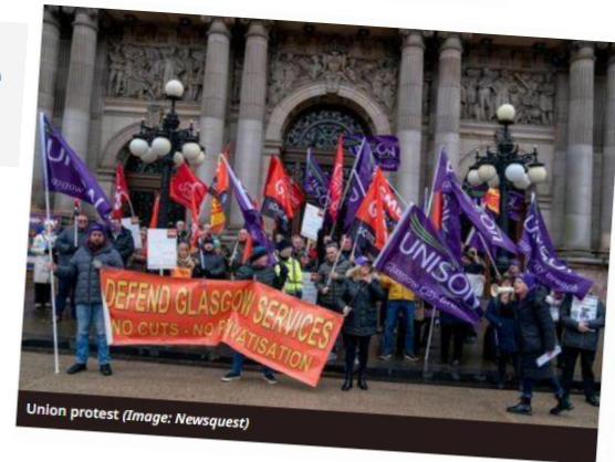
Union protest