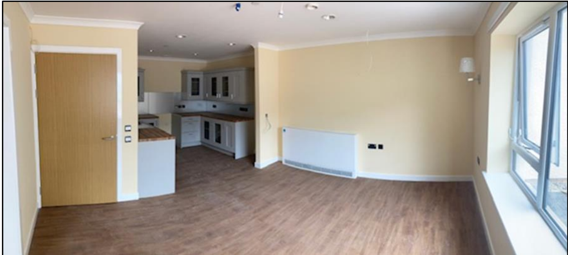
Housing with Extra Care – Living area within flat