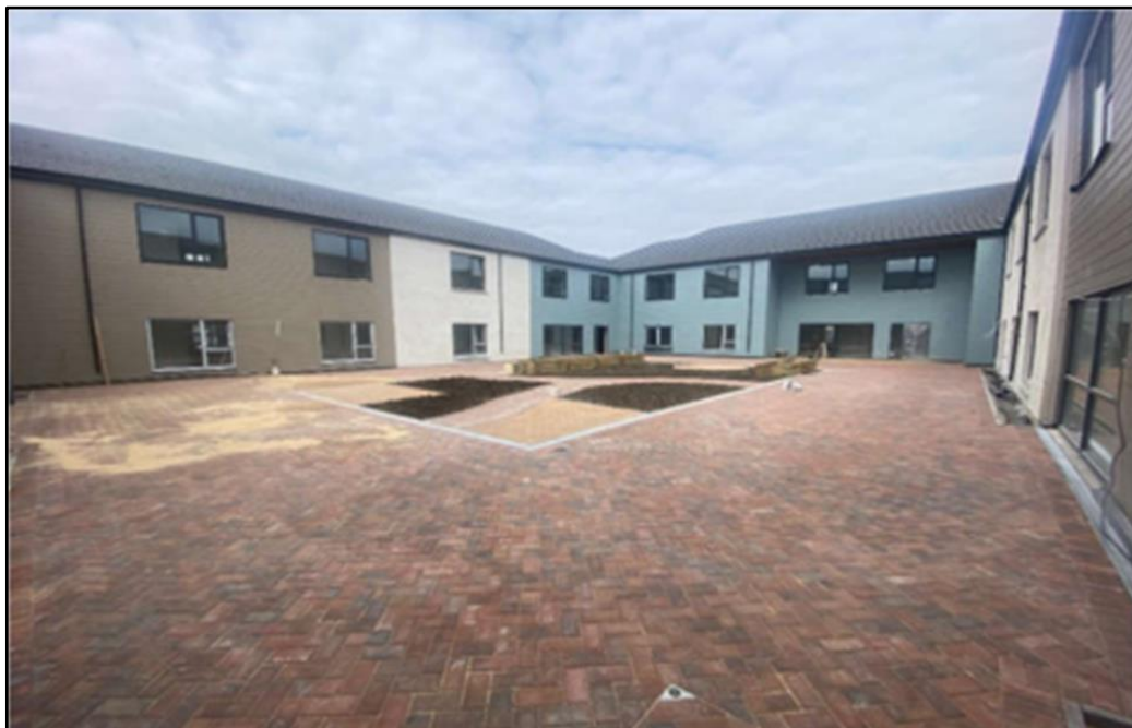
Housing with Extra Care – Courtyard