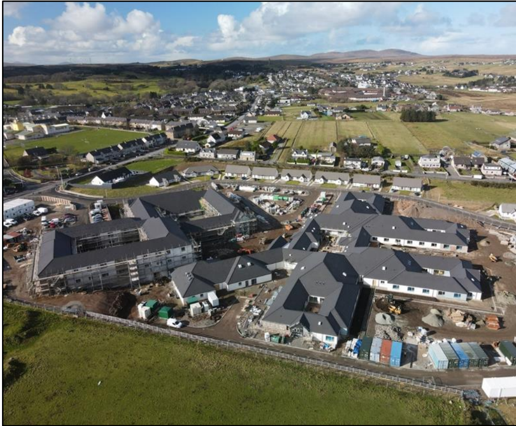
Care Home and Housing with Extra Care Aerial View