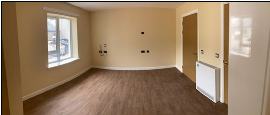
Housing with Extra Care – Bedroom