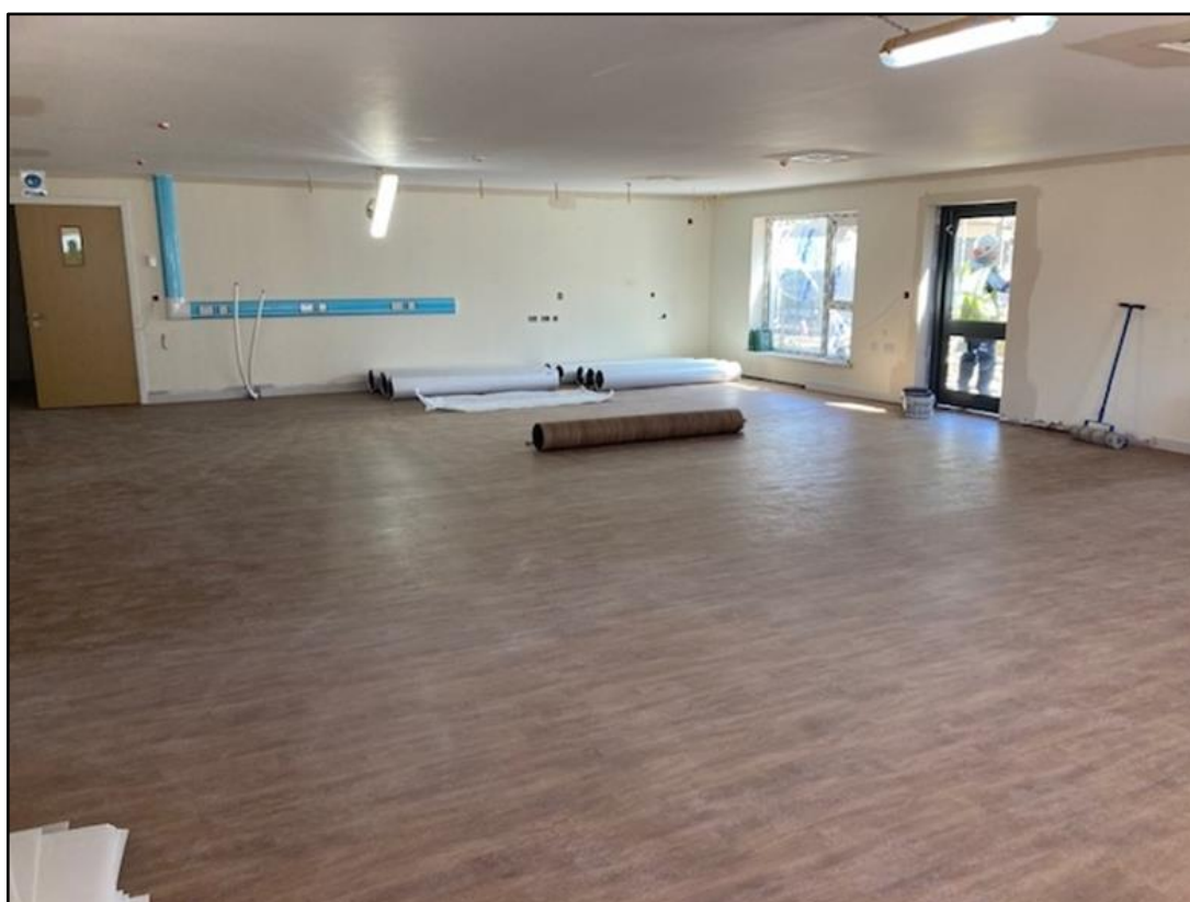
Care Home – Training Area