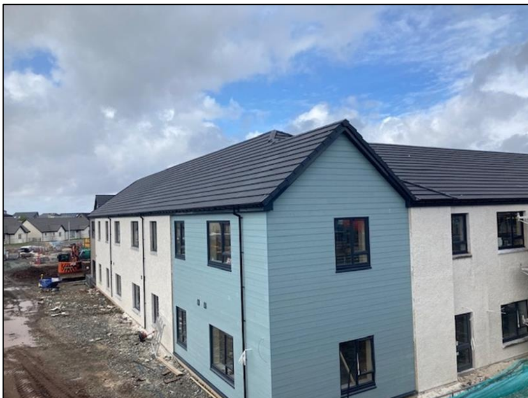
Housing with Extra Care