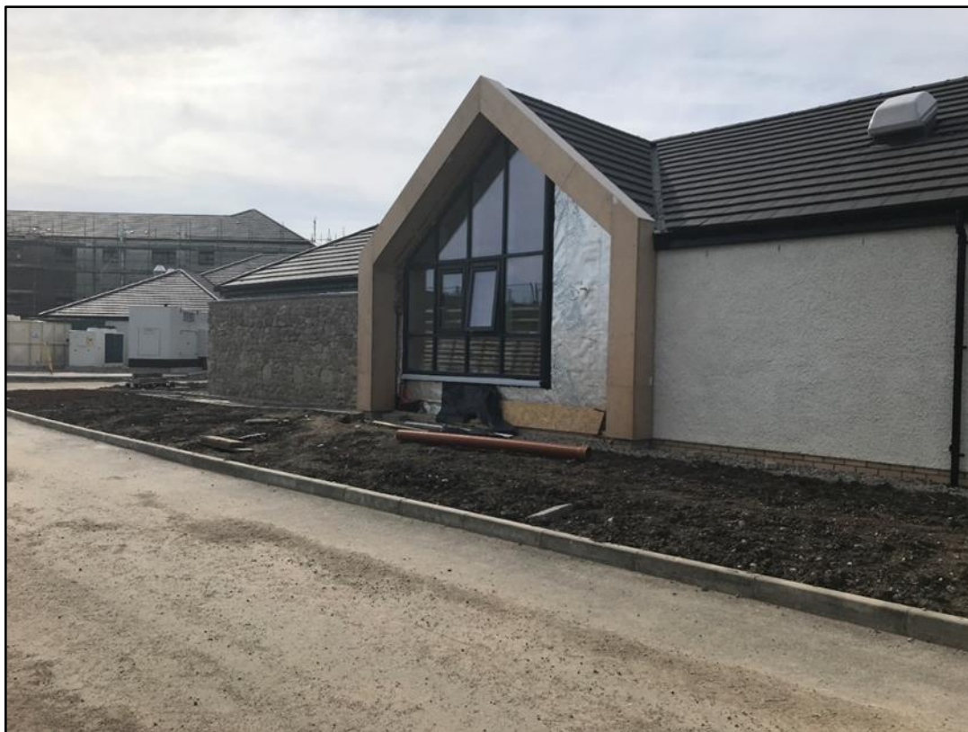
Care Home - Wing Gable