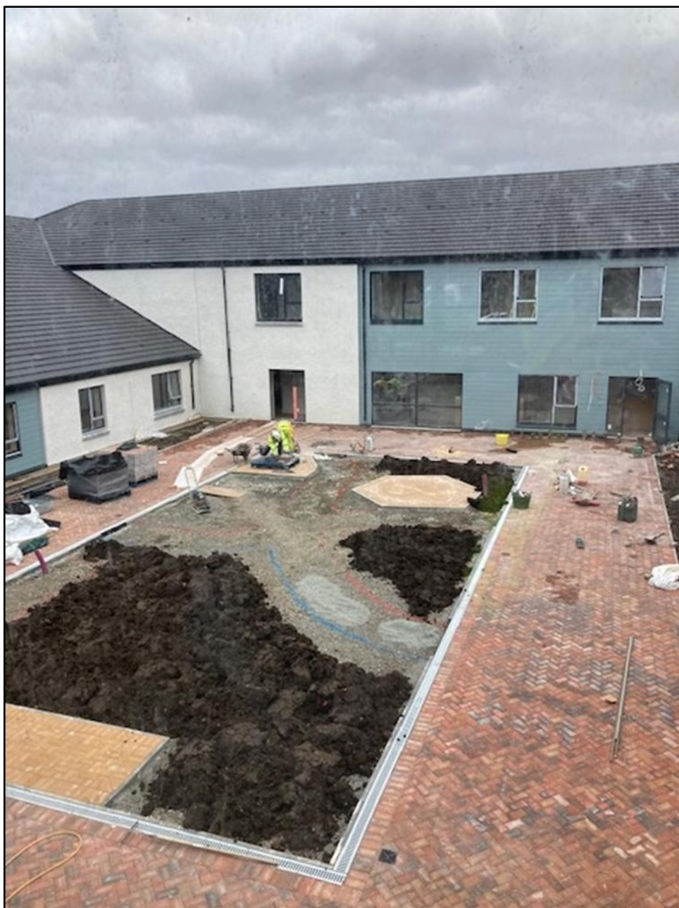
Housing with Extra Care – Courtyard