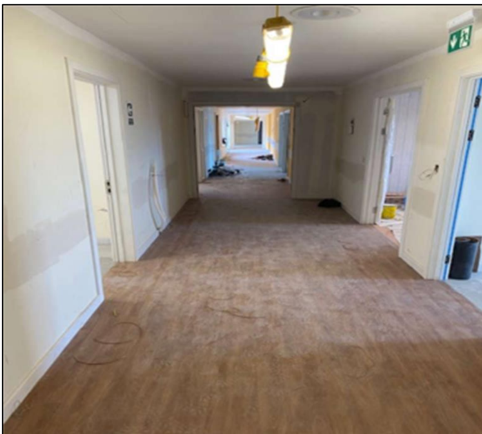
Care Home - Circulation