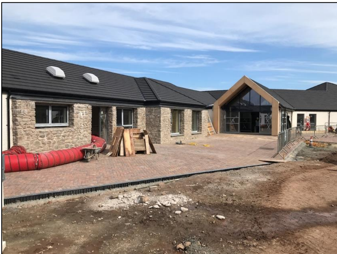
Care Home Main Entrance