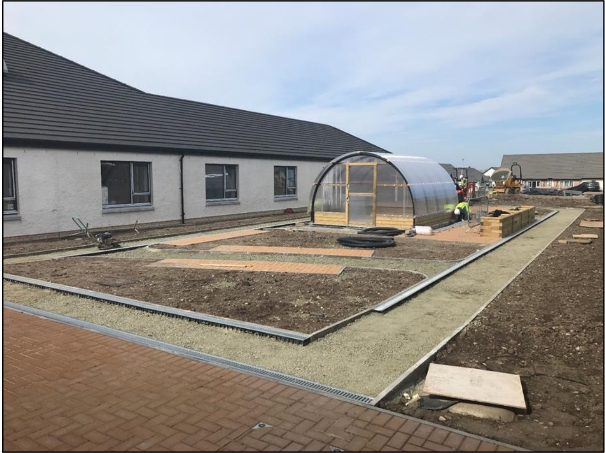
Care Home - North Courtyard