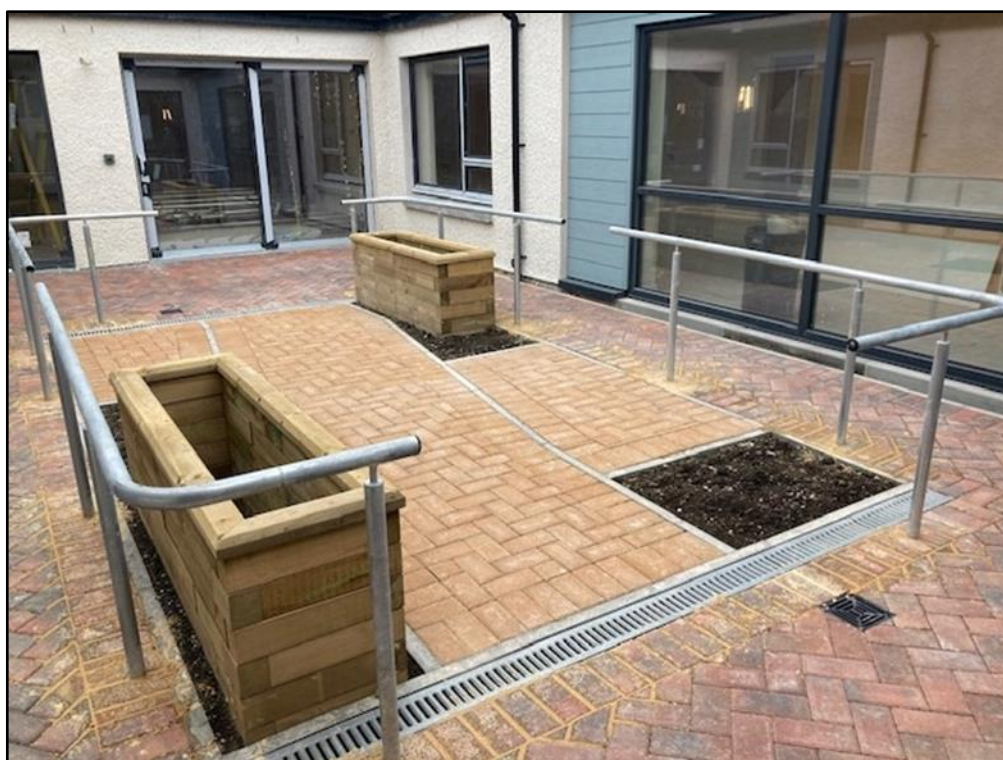
Care Home – Wing Courtyard