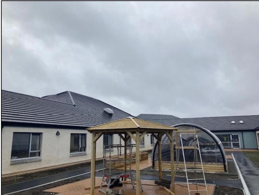
Care Home - North Courtyard